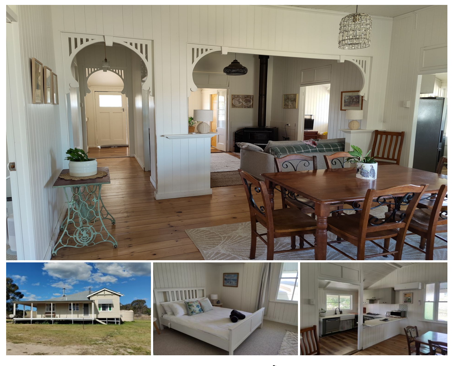
741 Thorndale Rd Glen Aplin QLD

This beautiful partly furnished 2 bedroom, plus office or 3rd bedroom cottage is located in the heart of the Granite Belt wine region. Approximately 10 minutes drive from Stanthorpe and Ballandeen with views of picturesque countryside.