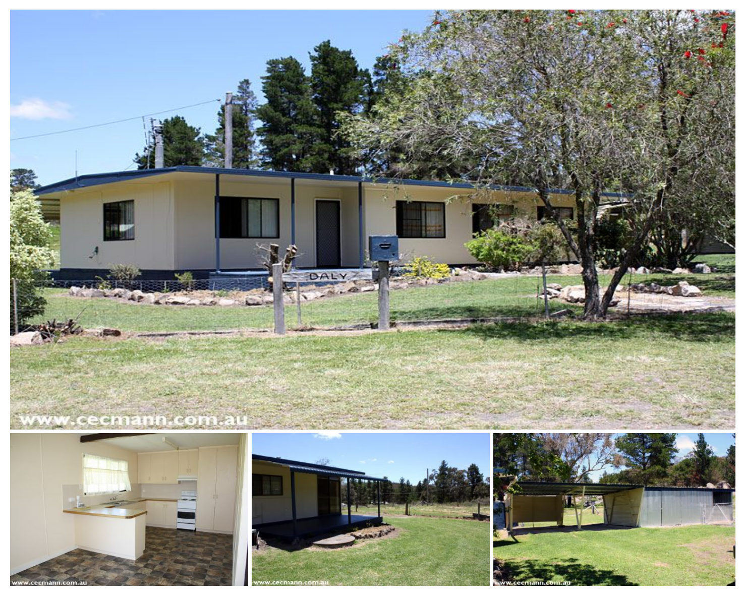
150 Dalcouth Road Stanthorpe QLD

This very clean and tidy four bedroom home is situated approximately 5 mins from town and features lounge with air conditioning, open plan living with functional kitchen and meals area. Double carport and single lock up garage with workshop area. Good sized yard. A ride on mower would be beneficial.